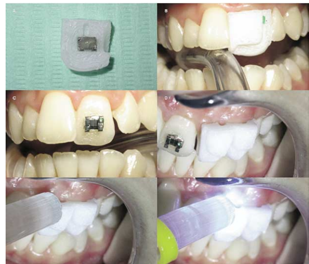
Fig 2. Clinical application of RPT: A , bracket in RPT with adhesive paste; B , RPT placed on tooth; C , RPT removal; D and E , RPT placement on adjacent teeth (full arch bonding can be undertaken); F , light-curing.

A high-end rapid prototyping machine is used to convert the virtual trays into the final real product, made of a rigid-elastic plastic material (Fig 2, A and B).